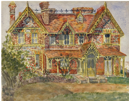
The Rectory, Pett, Sussex