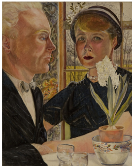
At the Cafe

Sylvia Sleigh’s works have been shown all over the world and hang in the National Portrait Gallery in London, The Art Institute of Chicago and other major museums across the United States. Parity’s endowed Sleigh works are offered for sale through The Parity Store.