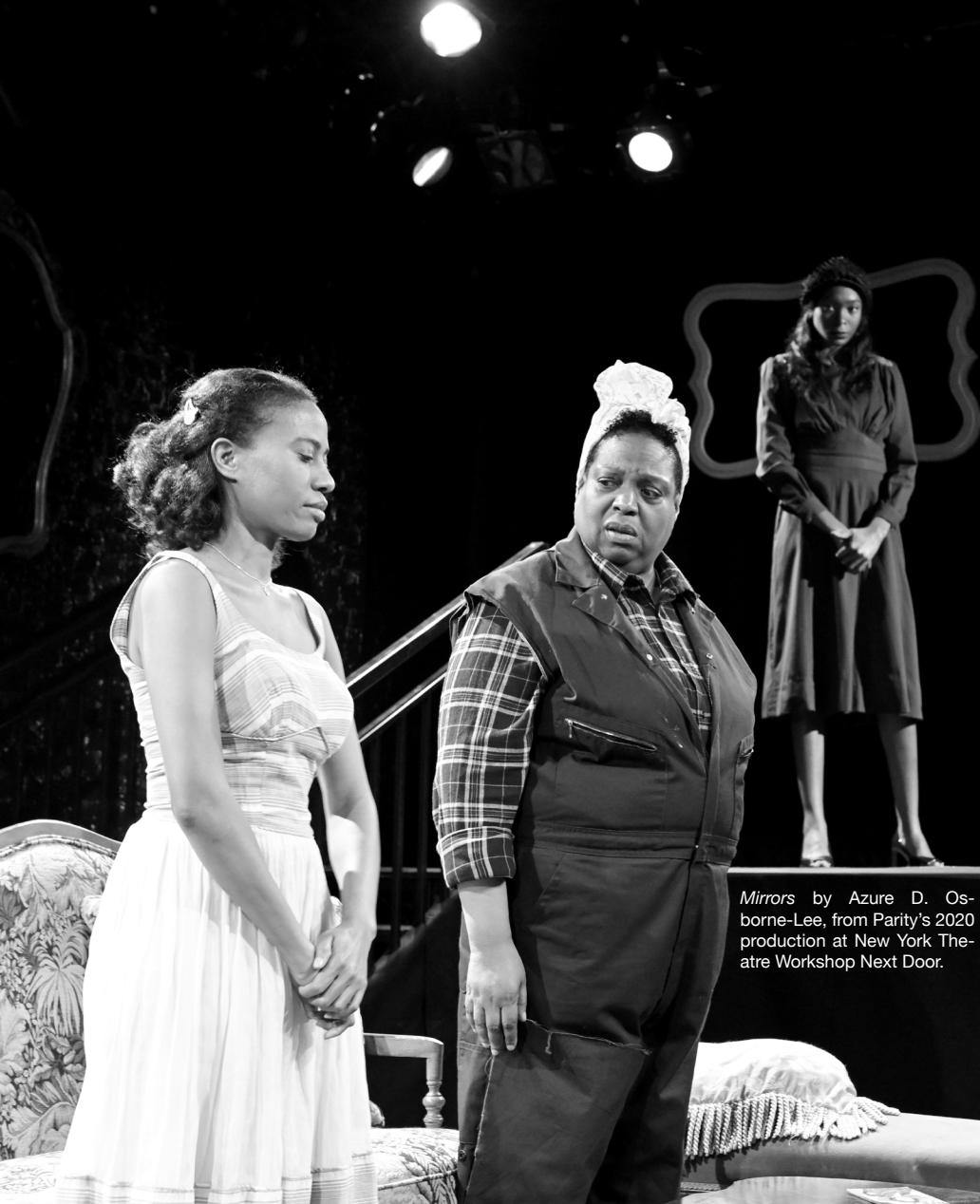
Mirrors by Azure D. Osborne-Lee, from Parity's 2020 production at New York Theatre Workshop Next Door.